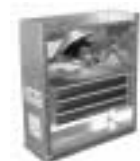
DOWNFLOW (STANDARD UNIT)

Standard downflow units may be field modified into upflow units by removing the 4 screws that hold the plenum and by flipping the plenum upside down. Re-insert and tighten the screws back into place.